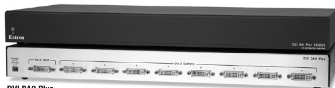
DVI DA8 Plus

The Extron DVI DA Plus are DVI distribution amplifiers with four, six, or eight outputs. Each product accepts a single link DVI signal from a source and distributes the signal to multiple attached devices. All DVI DA Plus models feature EDID Minder® and automatic input cable equalization. They are ideal for use in all applications that require reliable distribution of high resolution DVI digital video signals.