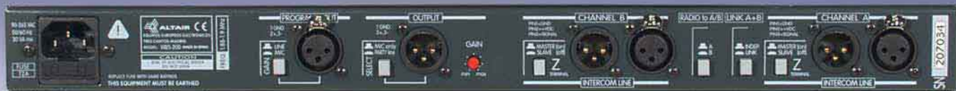
WBS-200 Rear panel