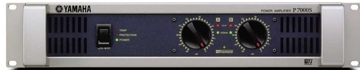
P7000S Front Panel