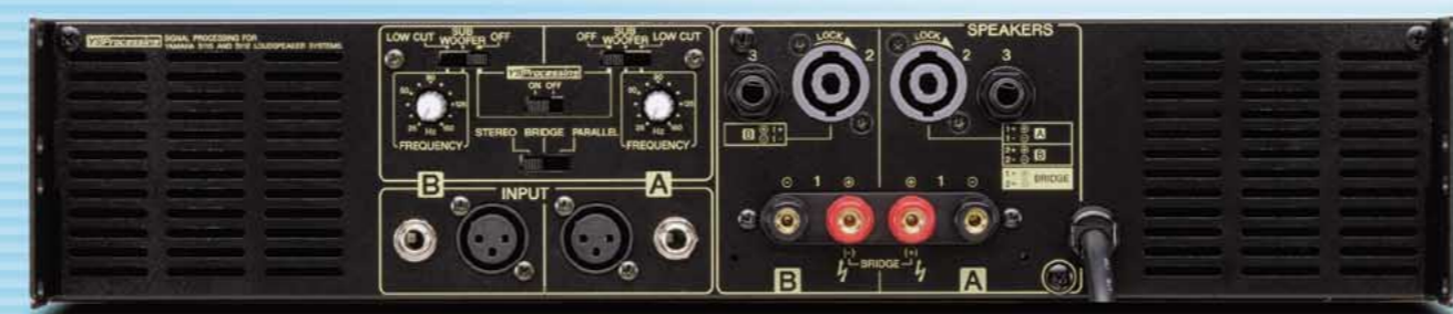
P7000S Rear Panel

To provide the most flexible connectivity possible, all four models are equipped with